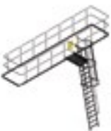
LADDER AND HANDRAIL