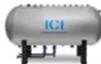
VEX Steam accumulator