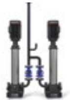
MODULATING WATER SUPPLY GROUP (Optional with Inverter on board pumps)