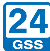
GSS 24 PLUS Steam safety system for exemption from operation for up to a maximum of 24 hours