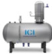
DEG/P Pressurized degasser