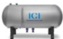
DEG Atmospheric degasser